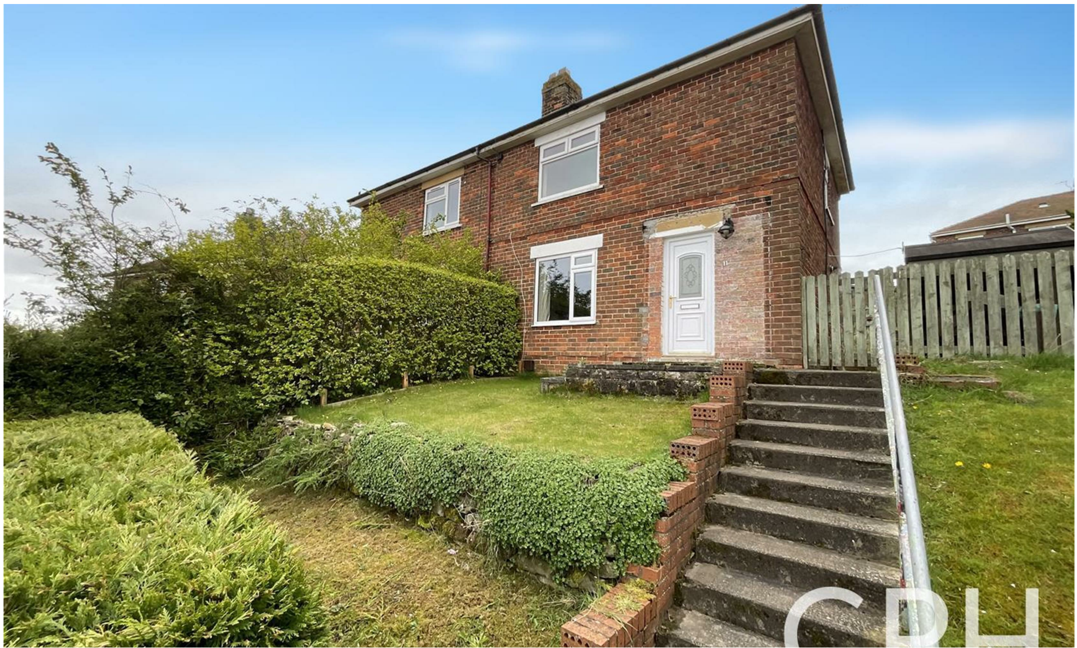
11 The Croft, Scarborough YO12 5JD Asking Price £170,000